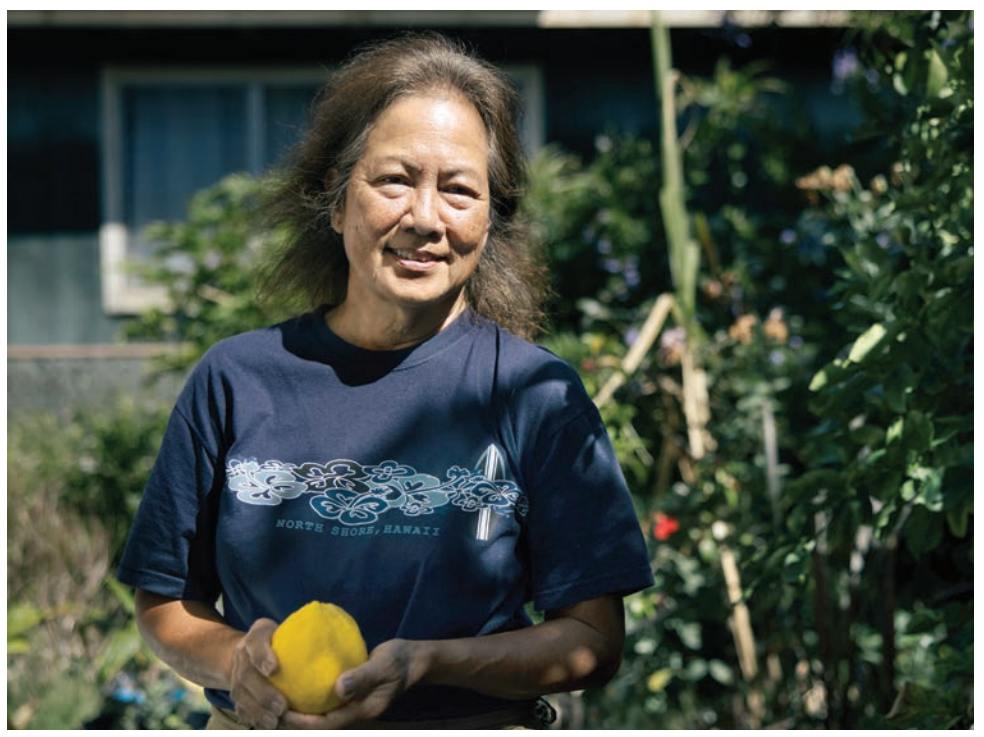
continued from page 1

keeps us motivated to support our Maui community in every way we can during this time of need.