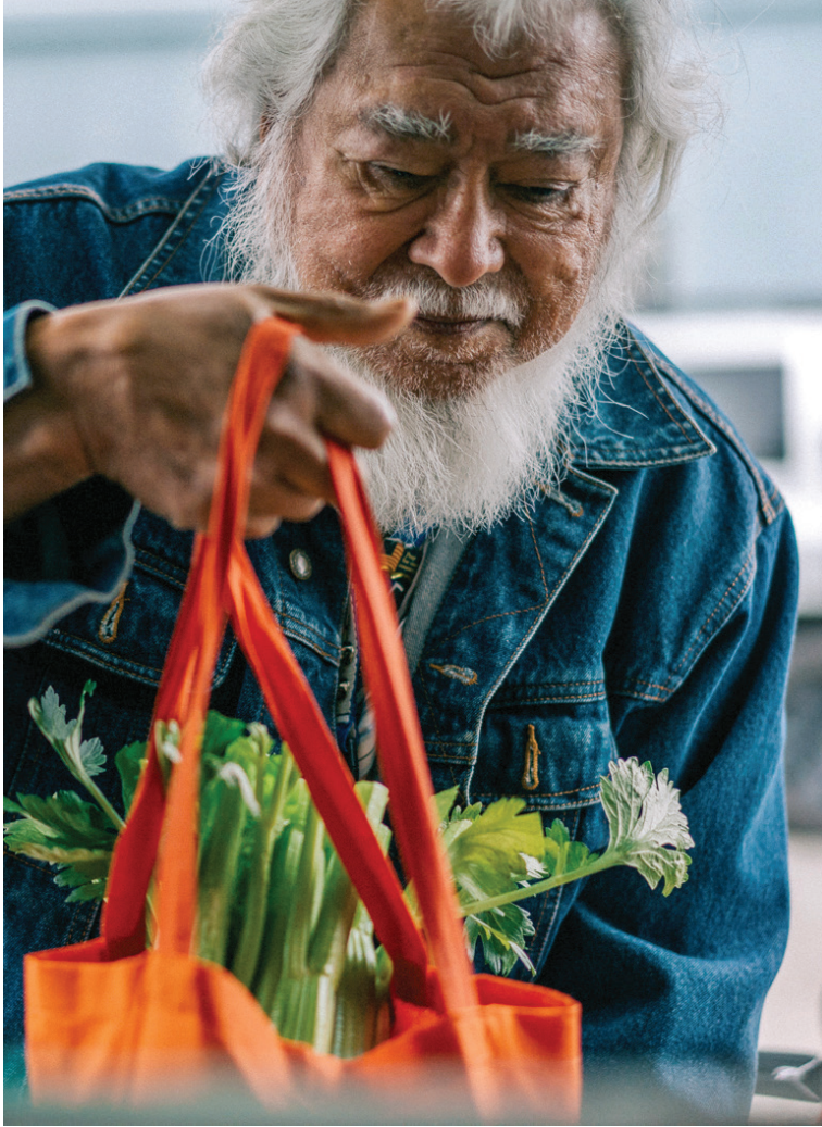
Senior Food Boxes contain supplemental foods such as produce, meat, rice, cheese, cereal, peanut butter and more. Last year, our Senior Food Box Program on O'ahu and Kaua'i provided food for more than 475,000 meals.

and ensure the inclusion of culturally important foods in hunger relief programs helps ensure the well-being of our 'ohana and the resilience of our communities.